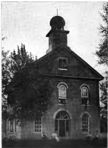
OLD HANCOCK COUNTY COURTHOUSE

Built 1867-1869, Occupied in the fall of 1868. Abandoned in 1896.